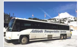
ONC-PDX Ski Bus