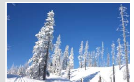
Lake Creek Lodge trip has openings, see page 9