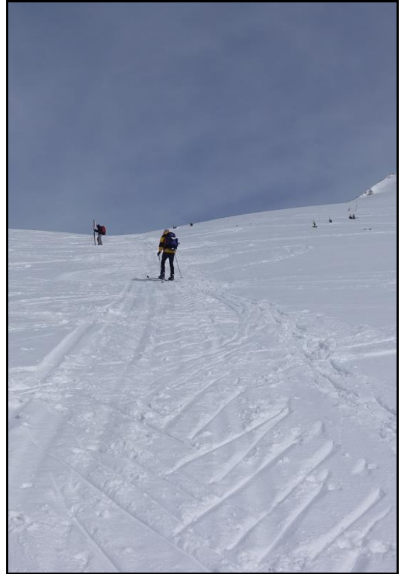
Climbing up pass at 8,200 feet