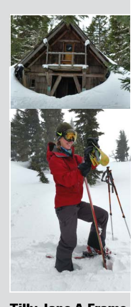
Tilly Jane A-Frame See trip details page 6.