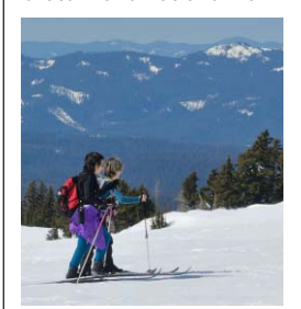
Crater Lake National Park