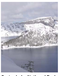
Crater Lake National Park