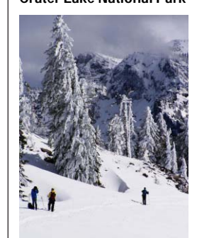
Crater Lake National Park