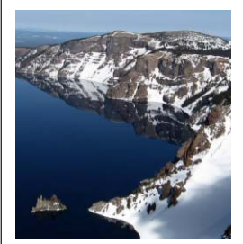
Crater Lake National Park