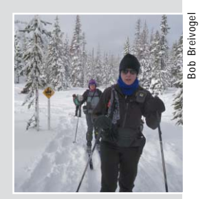
Black Butte See trip details page 5.