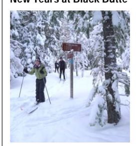
New Years at Black Butte