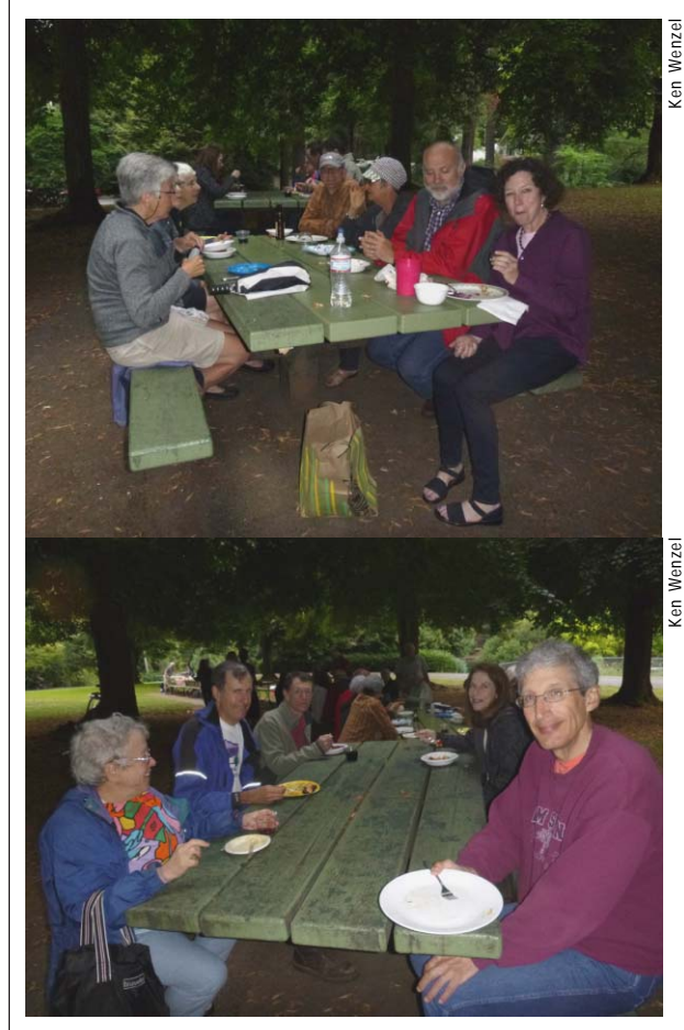
ONC-PDX Annual Picnic

Info and maps: portlandoregon.gov/transportation/58929