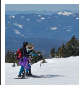
Crater Lake National Park