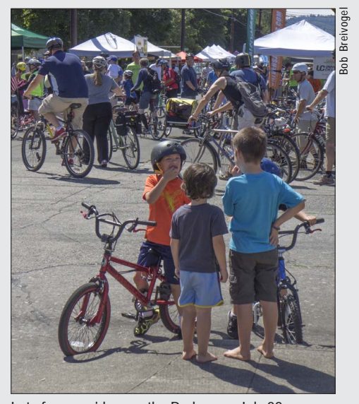
Lot of young riders on the Parkways, July 28

Enjoy the added walk-only route, rolling hills, beautiful views, and Hillsdale and Multnomah business districts. Activities, music, food, and vendors will be located in Gabriel Park, Multnomah Village, and Hillsdale Shopping Center. Route TBD .