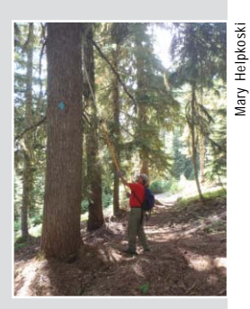
Come join us on August 21 to work on the winter trails at Mt. St. Helens See page 4 for specifics