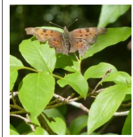
St. Helens view, flowers & butterfly, Observation Peak