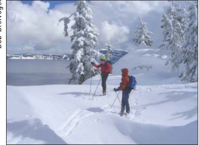
Crater Lake National Park