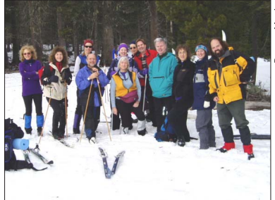
Flying L Ranch