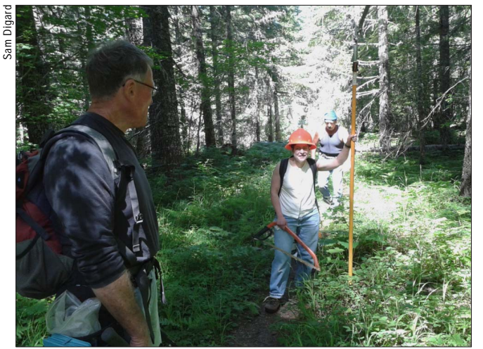
ONC trail tending volunteers working on the trail

While skiing the Terminator trail during this last winter, large areas of blow down blocked the trail, making it almost impossible to negotiate. The goal of the workday on July 20 was to clear this from the trail. During Saturdays trail workday, there was no trace of the blow down or any indication of recent trail repair activity.