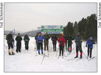
Glacier National Park