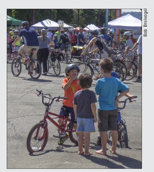
Lot of young riders on the Parkways, July 28

Enjoy the added walk-only route, rolling hills, beautiful views, and Hillsdale and Multnomah business districts. Activities, music, food, and vendors will be located in Gabriel Park, Multnomah Village, and Hillsdale Shopping Center. Route TBD .