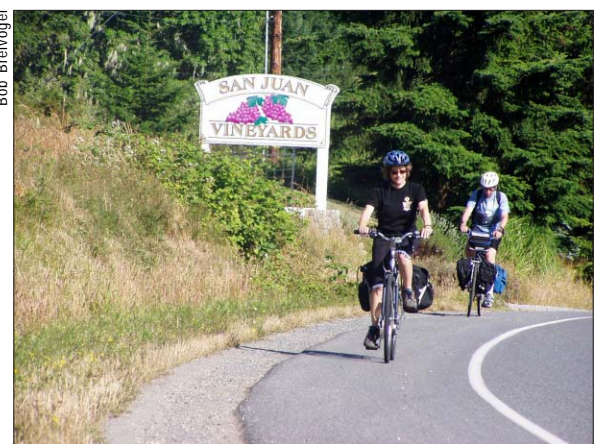
Biking to the campground on San Juan Island

Let's continue an ONC tradition—bike the San Juan Islands in Washington state on July 4th weekend. Explore these magical islands—on San Juan, we'll visit English Camp and American Camp in the National Historical Park,