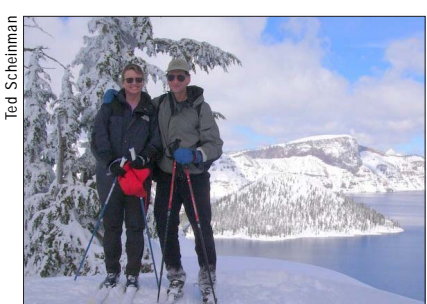
Crater Lake rim, Wizard Island behind

The Crater Lake rim, at 7,000 feet, averages 44 feet of