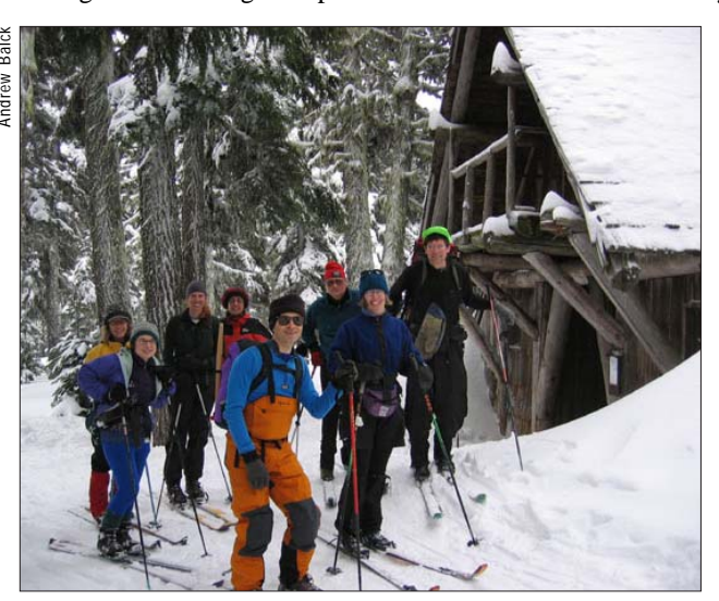
Tilly Jane A-frame overnight trip

Tilly Jane A-Frame Eleven club members from the Portland Chapter worked on the building over the New Years' weekend. They finished securing the A-Frame, as required in the new USFS agreement, added some door locks, hung clothes pegs, cleaned up a bit and partied much too hard for our ages. The skiing was phenomenal on New Years Eve day with 18 inches of new, dry snow