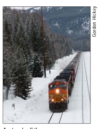
Amtrack all the way