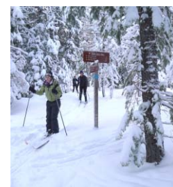
New Years at Black Butte