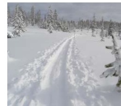
New Years at Black Butte