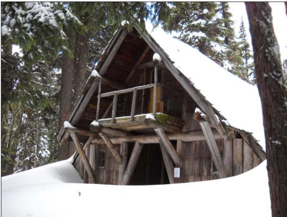
Tilly Jane A-Frame surrounded by a white blanket of ...