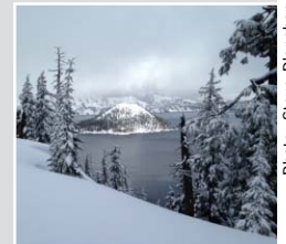
Plenty of snow at Crater Lake . . .